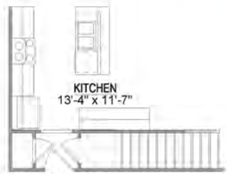
OPTIONAL DELUXE KITCHEN