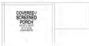
OPTIONAL COVERED OR SCREENED PORCH