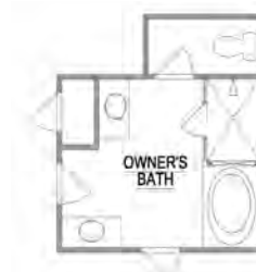
OPTIONAL DELUXE BATH