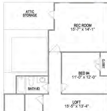
OPTIONAL BED 4, BATH 3